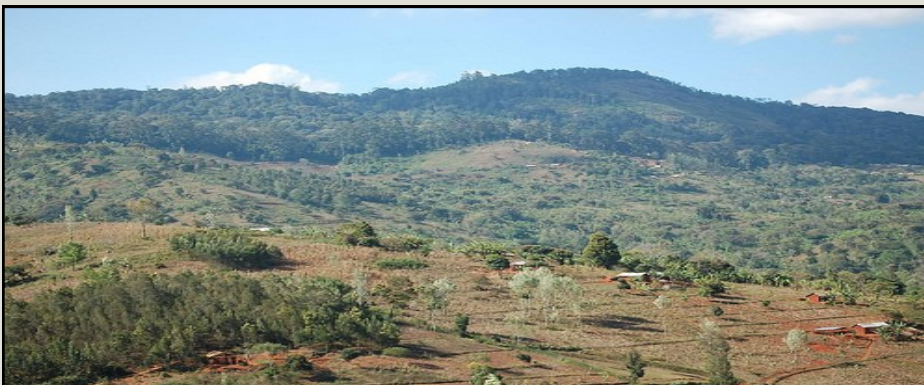
The highlands in Tanzania

IFC's investment will help Green Resources create 500 permanent jobs and 5000 seasonal positions by 2011, mainly at its plantations.