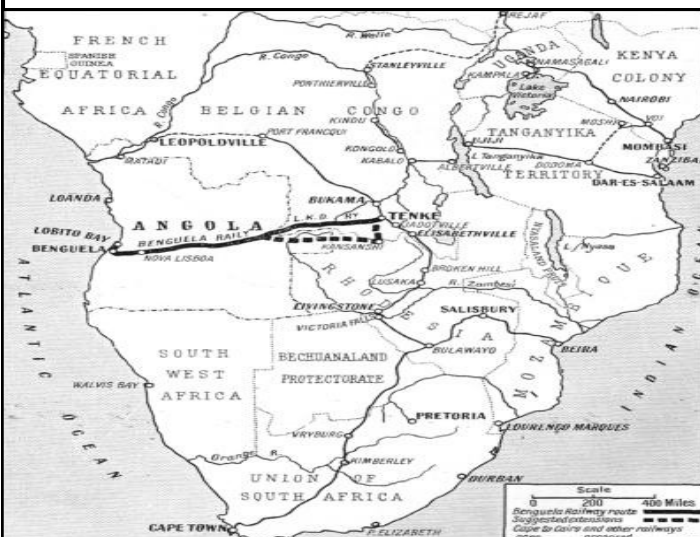
The rail line snakes through Angola.

Whatever the case, the Benguela Rail has seen its fair share of turmoil, and the future holds promise.