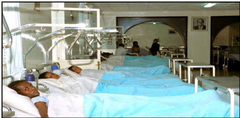
A hospital in Adisa Ababa

This is the first major transaction involving Standard Bank and ICBC.