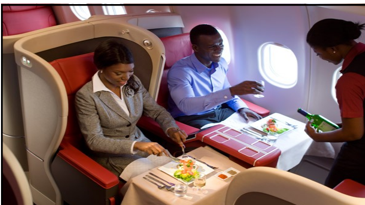
Arik also promises passengers fine dining on flights.

strategically important because it will greatly improve accessibility and help to develop stronger economic ties and trade relations between Nigeria and the three West African states.