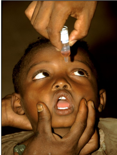
Polio immunization in Ethiopia

Although viable investment opportunities from all parts of Africa will be considered, priority countries include Côte d'Ivoire, Ghana, Kenya, Nigeria, Senegal, Tanzania, and Uganda. Angola, Burundi, Democratic Republic of