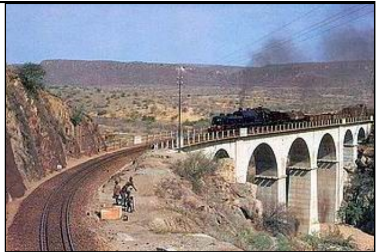
Benguela runs across many bridges and through tunnels. As seen below, it is also a key mode of transportation for the population.

During the war, the warring factions dynamited the steel tracks, blew up bridges, bombed railway stations and derailed