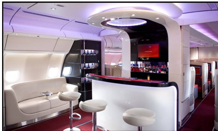
The premier cabin on Arik Air flights offers an array of exquisite services