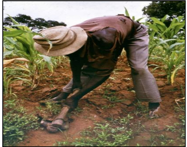
Negative effect of climate change pronounced in Sub-Saharan Africa.

In a no-climate change scenario, only Sub-Saharan Africa (of the 6 regional groupings of developing countries studied in the report) sees an increase in the number of malnourished children between 2000 and 2050, from 33 to 42 million. Cli-