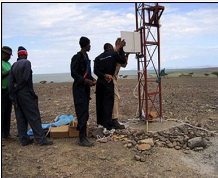
Men at work at the construction site, located near Lake Turkana in the Great Rift Valley of Kenya.

Average electricity production is estimated at 1,440 GWh per year. Engineers have been measuring wind speeds and frequency in the project area for the last 30 months at 40, 60 and 80 meters altitude. The average wind speed in the project area has been recorded to be