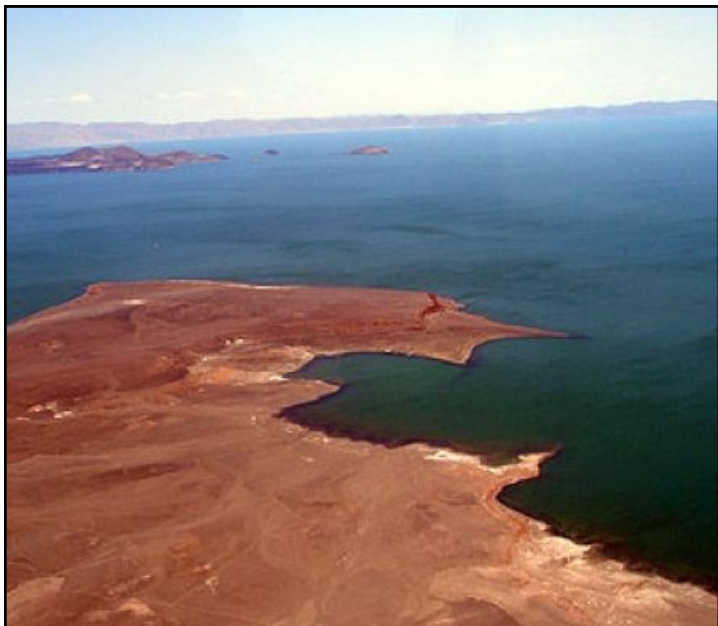
Lake Turkana to the west of the project area harbors a great variety of aquatic animals, including crocodiles, hippos, fish and birds.