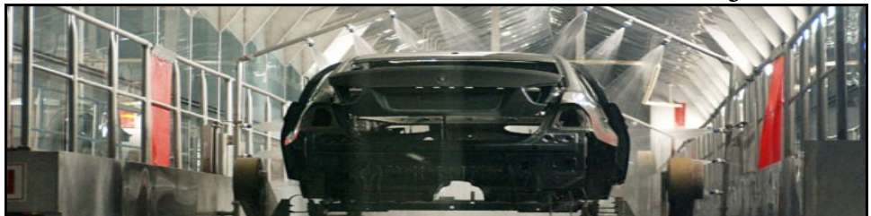
With investment, BMW hopes to secure production in Africa for foreseeable future.

'This is a very, very significant statement,' Trade and Industry Minister Rob Davies said. 'This is a major ... statement of confidence in the South African economy, especially a time