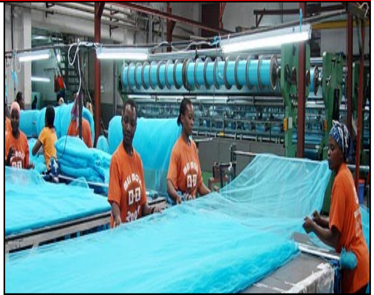
A to Z Textile Mills, a Tanzanian manufacturer, produces bednets impregnated with a long-lasting insecticide.

In Africa, the Acumen Fund has made several investments in Kenya and Tanzania. Among them are: