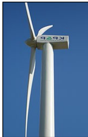
Transporting these large wind propeller blades could be a logistical nightmare.

There are also delicate environment concerns, including rare fish and wildlife that cannot be disturbed.