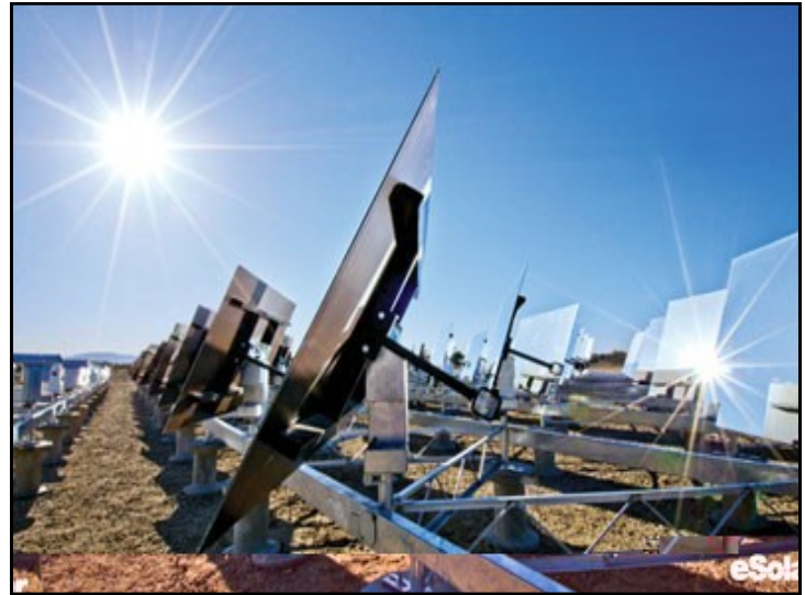
eSolar finds a partner in South Africa to foster sales in sub-Saharan Africa.

"Sub-Saharan Africa's tremendous solar resource has