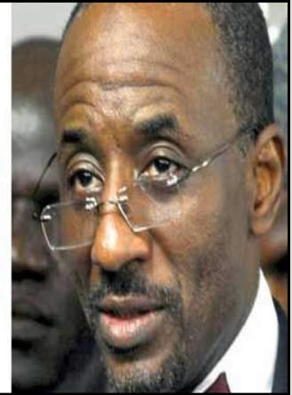
Central Bank Governor Lamido Sanusi has made cleaning up the banking system in Africa's most populous nation his top priority.