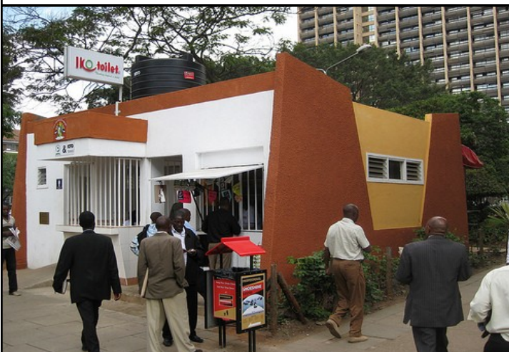
Ecotact, one of the companies The Acumen Fund has invested in, builds and operates these pay-per-use toilets.

• Jamii Bora Trust, which started off as a trust for beggars, has grown into the largest microfinance institute in Kenya, with over 170,000 members. It works in slums throughout country. The Jamii Bora Trust has recently launched Kaputei Town, an urban planning project 60 km south of Nairobi which is designed to be ecofriendly and will include residential neighborhoods, commercial, cultural and social centers as well as a wetlands wastewater recycling facility. The Acumen Fund provided the microfinance institute with $250,000 in debt financing.